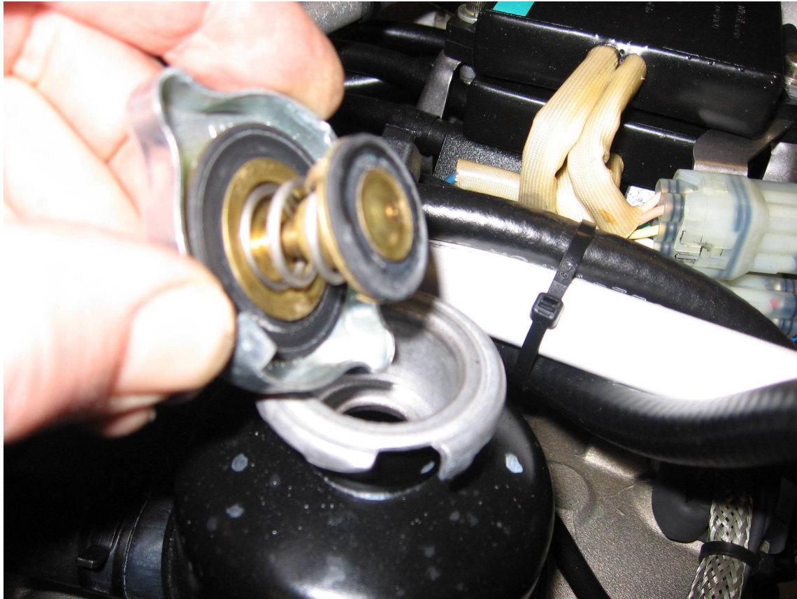
Fig 2 Expansion bottle cap showing both rubber seals and compression spring